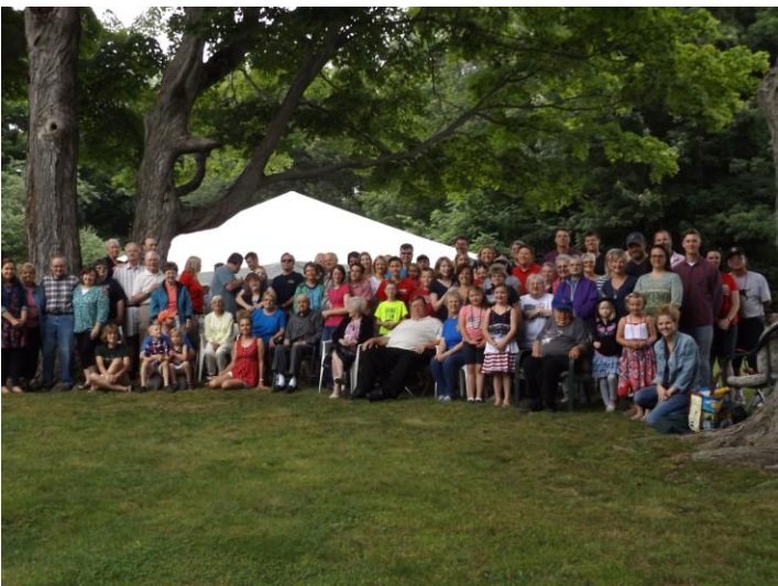
Fourth of July, 2015

week and more church family meals are shared. A monthly non-traditional worship service for handicapped persons has begun and is growing. The church's young adults are planning and implementing a new outreach to the community centered on the newly refurbished Potter's House, formerly the Fireplace Room. There is a sense of positive momentum as the church observes the milestone of its 125<sup>th</sup> Anniversary and begins the next phase.